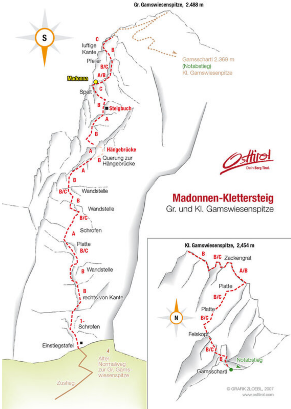
Madonnen-Klettersteig Gr. und Kl. Gamswiesenspitze